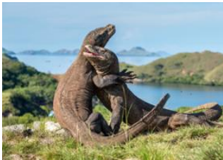
Siaba Besar Island