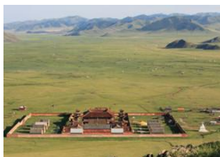
Ulan Bator 📍 🚗 350km - ⌚ 5h 30m Amarbayasgalant 📍