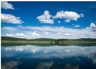
Uran Togoo national park 📍