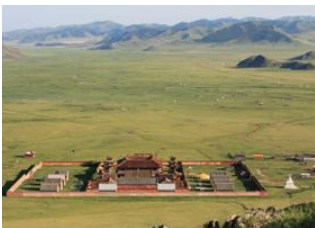
Ulan Bator 📍