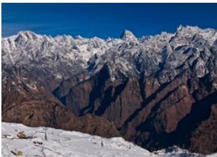
Ghangaria 📍 13km - ⌚ 4h Govindghat 📍 🚗 20km - ⌚ 30m Joshimath 📍