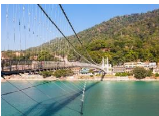
Joshimath 📍 🚗 260km - ⌚ 7h 30m Rishikesh 📍