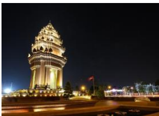
Airport Phnom Penh 📍 🚗 7km Phnom Penh 📍