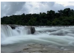
Phnom Penh 📍 🚗 285km - ⌚ 4h 40m Tatai 📍 🚗 50km - ⌚ 1h Koh Kong 📍