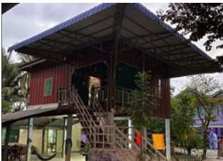
Koh Kong 📍 🚗 165km - ⌚ 3h Kirirom 📍