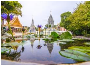
Koh Rong 📍 🚶 20km - ⌚ 1h Sihanoukville 📍 🚗 270km - ⌚ 3h Phnom Penh 📍