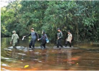
Koh Kong 📍