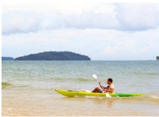
Koh Rong 📍 Koh Rong 📍