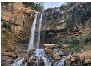
Kirirom 📍 🚗 160km - ⌚ 3h 30m