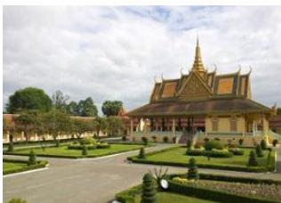
Phnom Penh 📍