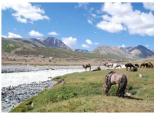
Altai mountain pass 📍 20km - ⌚ 5h Tahilbai valley 📍