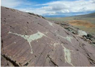
Shiveet Khairkhan 📍 25km - ⌚ 5h Tsagaan river 📍