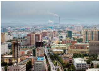
Olgii 📍 ✈ 1700km - ⌚ 2h Ulan Bator 📍