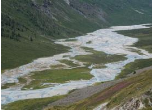
Potanine glacier ♡ 20km - ⌚ 6h 30m Tsagaan river ♡