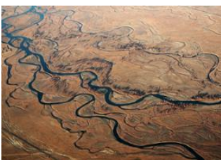
Flight back 📍