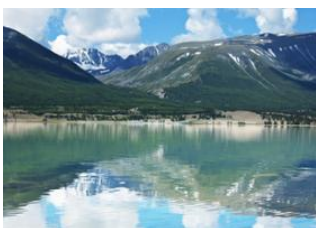
Khoton lake 📍 14km - ⌚ 4h Khurgan lake 📍