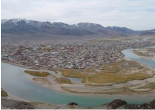
Khurgan lake 📍 🚗 220km - ⌚ 6h 30m Olgii 📍