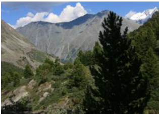
Tsagaan river ♡ 36km - ⌚ 11h Altai mountain pass ♡