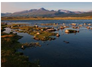
Tahilbai valley 📍 15km - ⌚ 4h Khoton lake 📍