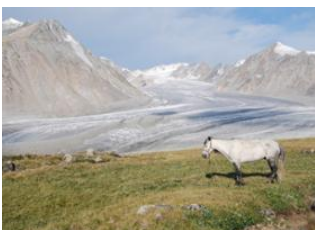
Tsagaan river 📍 16km - ⌚ 5h Potanine glacier 📍 12km - ⌚ 6h Potanine glacier 📍