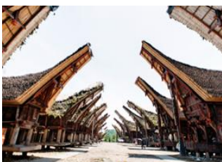
Makassar 📍 🚗 320km - ⌚ 8h Rantepao 📍