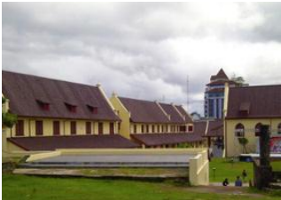
Makassar airport 📍 🚗 20km - ⌚ 40m Makassar 📍