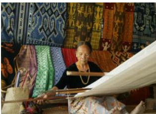
Rantepao 📍 🚗 210km - ⌚ 5h Sengkang 📍