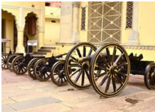
Ranthambore 📍 🚗 180km - ⌚ 4h 30m Jaipur 📍