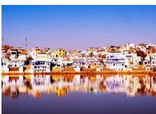
Jaipur 📍 🚗 145km - ⌚ 3h 20m Pushkar 📍