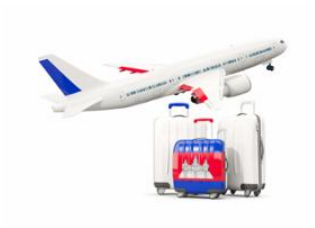
Phnom Penh 📍