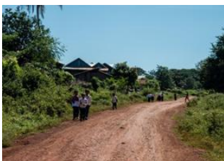
Phnom Penh 📍 🚗 545km - ⌚ 8h 30m Ratanakiri 📍