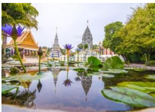
Airport Phnom Penh 📍 🚗 7km Phnom Penh 📍