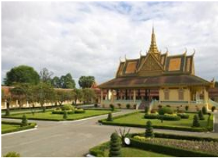
Phnom Penh 📍