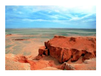
Ongi monastery ♥ ♣ 150km - ② 4h 30m Bayanzag ♥