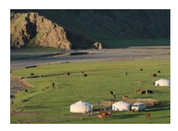
Kharkhorin ♥ ♣ 92km - ② 3h Tovkhon monastery ♥ ♣ 42km - ② 1h 15m Orkhon valley ♥