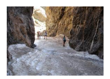
Khongor sand dunes ♥ ♣ 140km - ② 4h 30m Dungenee canyon ♥ ♣ 20km - ② 1h Yoliin am canyon ♥