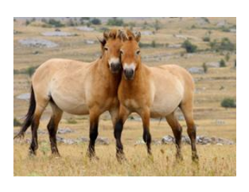
Ulan Bator ◊ ♣ 130km - ② 2h 30m Khustai national park ◊