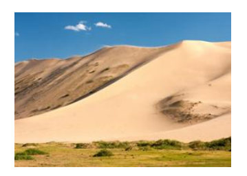
Bayanzag ♥ ♣ 130km - ② 4h 20m Khongor sand dunes ♥