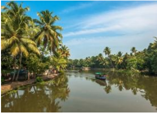
Periyar (Thekkady) 📍 🚗 150km - ⌚ 5h Alappuzha (Alleppey) 📍