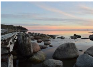
Alappuzha (Alleppey) 📍 🚗 60km - ⌚ 1h 30m Cochin (Kochi) 📍