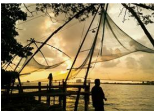
Cochin (Kochi) 📍