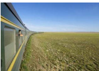
Khustai national park