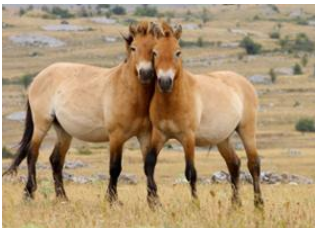
Khustai national park