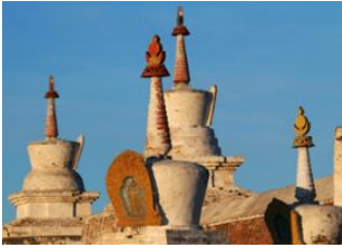
Tsenkher hot springs 140km - 2h 30m Kharkhorin