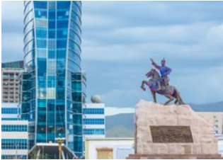
Ulan Bator 📍