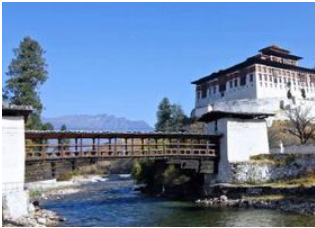
Punakha 🚗 137km - ⌚ 4h 30m Paro