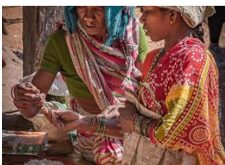
Rayagada 📍 🚗 140km - ⌚ 4h Jeypore 📍