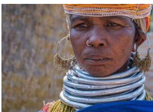
Jeypore 📍 🚗 300km - ⌚ 7h 20m Taptapani 📍