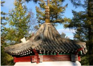
Terelj national park 📍 26km - ⌚ 6h Gunj monastery 📍