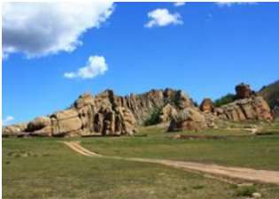
Gunj monastery 📍 46km - ⌚ 10h Terelj national park 📍