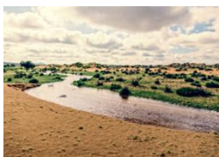
Ulan Bator 📍 🚗 280km - ⌚ 4h 30m Khogno Khan 📍