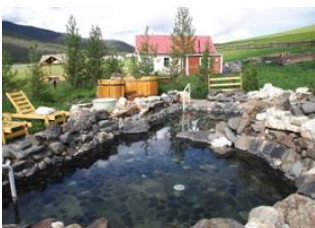
Orkhon valley 📍 🚗 42km Tovkhon monastery 📍 🚗 110km Tsenkher hot springs 📍