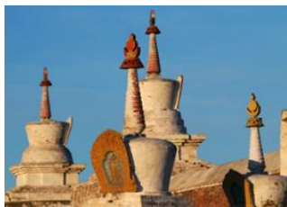
Khustai national park 📍 🚗 270km Kharkhorin 📍