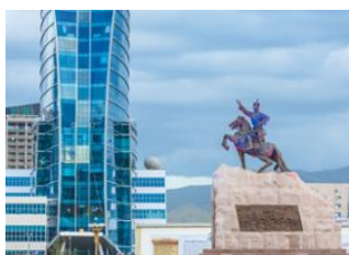
Ulan Bator 📍