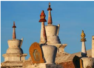
Ulan Bator 📍 🚗 380km - ⌚ 6h Kharkhorin 📍