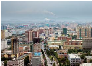
Terelj national park 📍 🚗 80km - ⌚ 2h Ulan Bator 📍