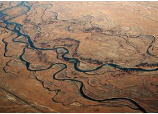
Flight back 📍