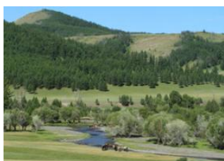
Ulan Bator 📍