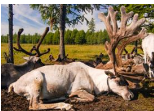
Tsagaan nuur 📍