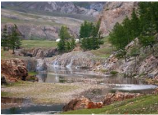
Alag Tsar 📍 🚗 170km - ⌚ 6h Oliin Dawaa 📍