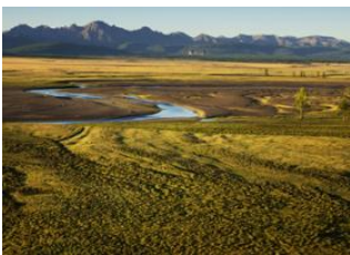
Oliin Dawaa 📍 🚗 80km - ⌚ 3h Tsagaan nuur 📍