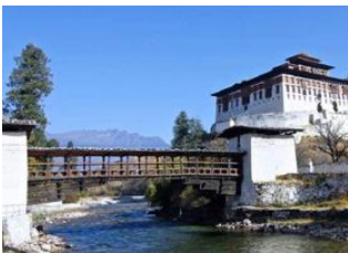
Thimphu 🚗 60km - ⌚ 1h 12m Paro