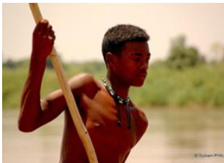
Ranohira 📍 🚗 300km - ⌚ 4h 30m Ifaty 📍