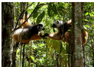
Antananarivo 📍 🚗 150km - ⌚ 3h Andasibe 📍