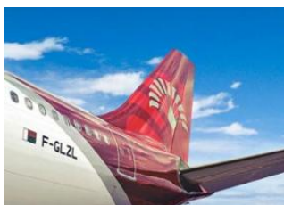
Paris Roissy CDG 📍 ✈️ 8500km - ⌚ 10h Antananarivo 📍