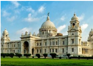
Kaziranga National Park 📍