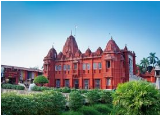
Sundarbans National Park 📍 🚗 112km - ⌚ 3h Kolkata 📍