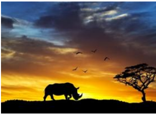
Kaziranga National Park 📍