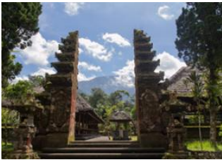
Belimbing 🚗 40km - ⌚ 1h 10m Batukaru Mount 🚗 10km - ⌚ 30m Jatiluwih 🚗 21km - ⌚ 1h Bedugul 🚗 42km - ⌚ 2h Ubud