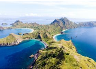
Kelor Island 📍 Rinca Island 📍