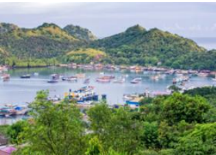
Rinca Island 📍 Manta Point (Komodo) 📍 Labuan Bajo 📍