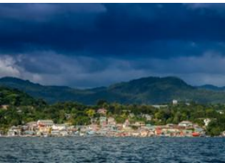
Labuan Bajo 📍