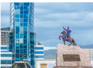
Terelj national park 📍 🚗 80km Ulan Bator 📍