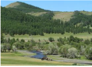
Terelj Village 📍 30km - 📍 8m Terelj national park 📍