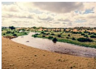
Ulan Bator 📍 🚗 280km - ⌚ 4h 30m Khogno Khan 📍