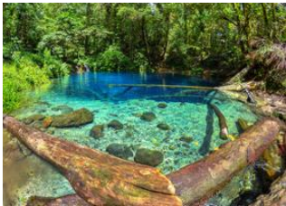
Bukit Lintang - 3h 20m Lac Kako