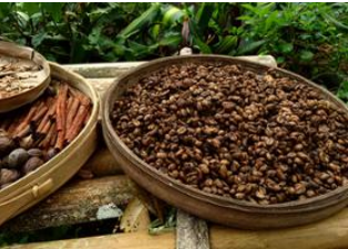
Lempur 📍 Bukit Lintang 📍