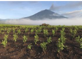
Padang 📍 🚗 - ⌚ 8h Lempur 📍