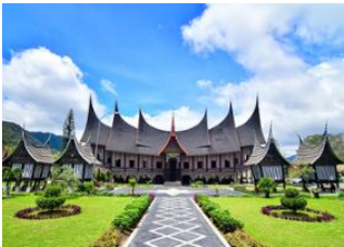
Lempur - 8h Padang