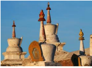
Khustai national park 📍 🚗 270km Kharkhorin 📍