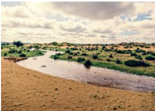
Naiman nuur 📍 🚗 260km Khogno Khan 📍