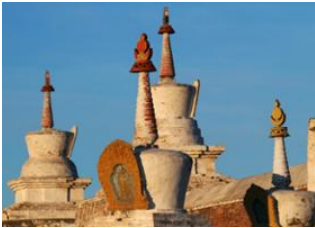
Khustai national park 📍 🚗 270km Kharkhorin 📍