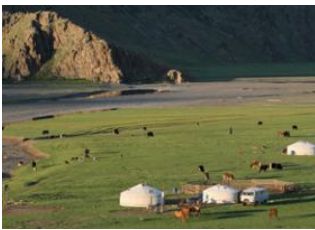
Kharkhorin 📍 🚗 92km Tovkhon monastery 📍 🚗 42km Orkhon valley 📍