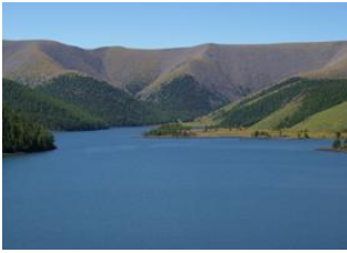
Orkhon valley 📍 🚗 260km Naiman nuur 📍