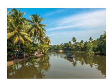
Chennmkary ♥ ♣ 25km - ② 1h Alappuzha (Alleppey) ♥