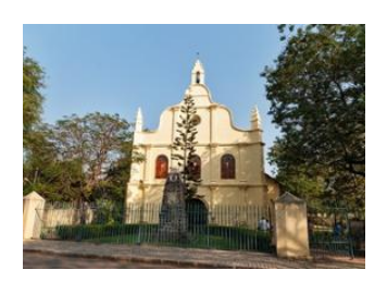
Cochin (Kochi) 9

• Today we visit Fort Kochi, founded by the Portuguese in 1503 and it is considered to be one of the earliest site chosen by European colonial power. An odour of spice emerges from warehouses and food stalls offering different delicacy is common sight in each nook and corner of the town. In the afternoon, we enjoy a sightseeing tour of Mattancherry Palace, built by the Portuguese as a gift for the Raja of Kochi, the Jewish synagogue dating from 1568 and St Francis church. We also explore the town of Kochi, its bazaars and old harbour area. In the evening there is the chance for an Optional visit to see a display of Kathakali, a form of classical dance unique to Kerala.