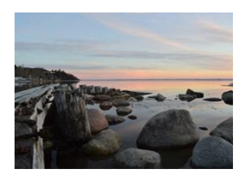
Jaipur ♥ ★ 2560km - ② 4h 50m Cochin (Kochi) ♥