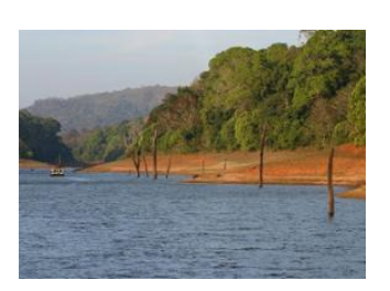
Cochin (Kochi) ♥ ☐ 170km - ② 4h 30m Thekkady ♥ Periyar (Thekkady) ♥