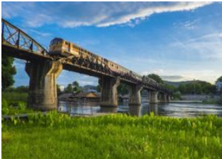
Amphawa 📍 🚗 100km - ⌚ 2h Kanchanaburi 📍