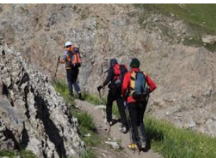
Achik-Tash Base Camp (3600 m) 📍 - ⌚ 6h Petrovsky Peak 📍 Achik-Tash Base Camp (3600 m) 📍