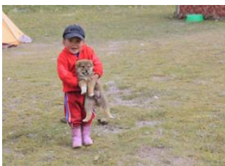
Camp N°2 Lenine