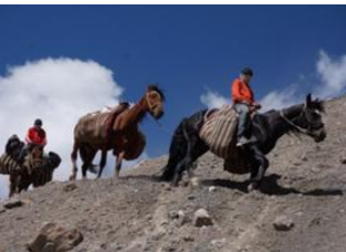
Achik-Tash Base Camp (3600 m) 📍 12km - ⌚ 6h Camp N°1 Lenine 📍