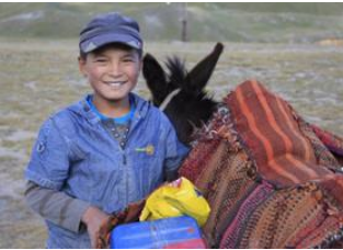
Achik-Tash Base Camp (3600 m) 📍