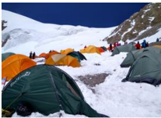
Camp N°2 Lenine