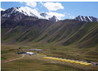
Bishkek 📍 ✈ 600km - ⌚ 40m Osh 📍 🚗 290km - ⌚ 8h Ashik-Tash Base Camp (3600 m) 📍