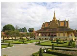
Airport Phnom Penh 📍 🚗 9km Phnom Penh 📍