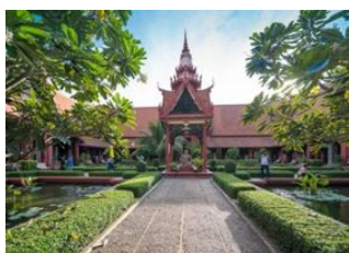
Phnom Penh 📍