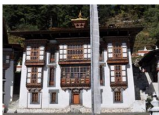
Toktu Zampa 9 12km - 4h 40m Ngang Lhakhang 9