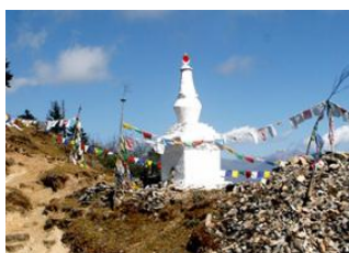
Ngang Lhakhang 9 16km - 6h Tahung 9