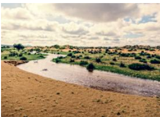
Ulan Bator 📍 🚗 280km - ⌚ 4h 30m Khogno Khan 📍