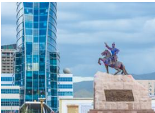
Ulan Bator 📍