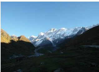
Bara Bhangal 📍