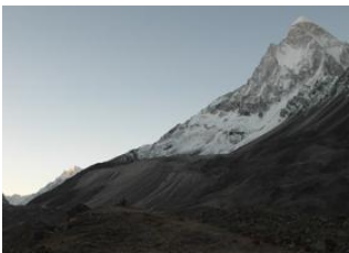
Lambapat 📍 13km - ⌚ 5h Bara Bhangal 📍