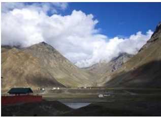
Devigot Camp 📍 7km - ⌚ 6h Lambapat 📍