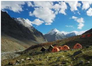
Riyali ♡ 7km - ⌚ 3h 20m Kaliheni Base Camp ♡