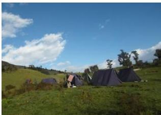
Kaliheni Base Camp ♡ 11km - ⌚ 6h Devigot Camp ♡