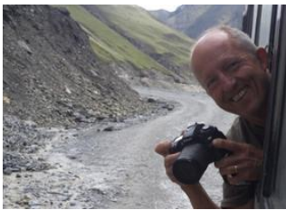
Lama Dugh ♡ 10km - ⌚ 6h Riyali ♡