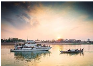
Phnom Penh 📍