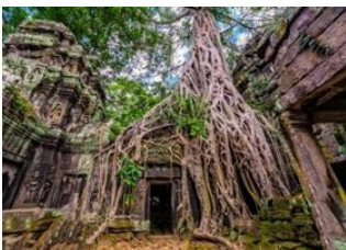
Siem Reap 📍