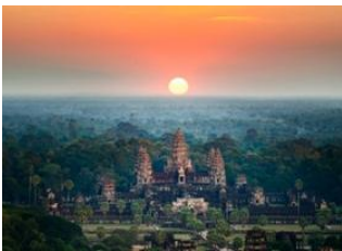
Siem Reap 📍