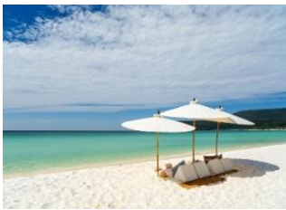
Koh Rong 📍