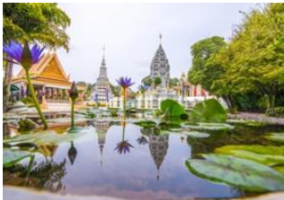
Koh Rong 📍