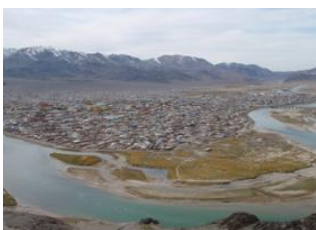
Shiveet Khaikhan 📍 🚗 220km - ⌚ 6h 30m