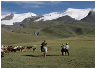
Altai mountain pass 📍 18km - ⌚ 4h Shiveet Khaikhan 📍