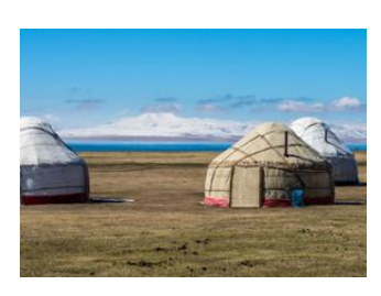
Kyzyl-Oi ♥ ♣ 180km - ② 4h Son Kul lake ♥