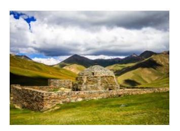
Son Kul lake ♥ ♣ 260km - ② 5h Tash Rabat ♥