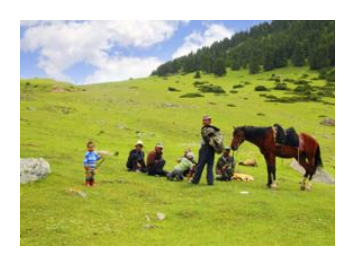
Bishkek ♀ ⇔ 200km - ⊙ 4h 20m Kyzyl-Oi ♀