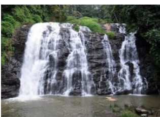
Kabini 📍 🚗 120km - ⌚ 3h Coorg 📍