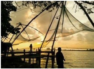
Cochin (Kochi) 📍