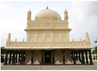
Mysore (Mysuru) 📍