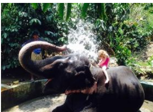
Mysore (Mysuru) 📍 🚗 60km - ⌚ 1h 30m Kabini 📍