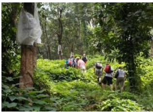
Neeleshwar 🚗 270km - ⌚ 6h Palakkad