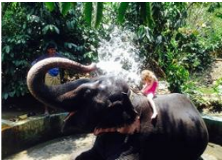
Mysore (Mysuru) 📍 🚗 60km - ⌚ 1h 30m Kabini 📍