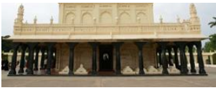
Mysore (Mysuru) 📍

scenic surroundings on an island formed by two branches of The River Cauvery. Several monuments relating to the sultan's rule are scattered across the island. We then return to Mysore and visit the Palace of the Maharaja (Emperor) , a harmonious synthesis of Hindu and Saracenic styles of architecture - with a plethora of magnificent archways, domes, turrets, colonnades and sculptures. We also visit Chaumundi Hill with its temple dedicated to Durga . On the road up to the Temple there is a giant monolithic Nandi bull , carved from a single piece of granite in 1659. Known for its sandalwood, Mysore is also famous for some of India's finest crafts, such as printed silk, inlaid furniture and ivory carvings.